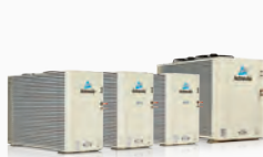
Split Ducted 9kW – 71kW