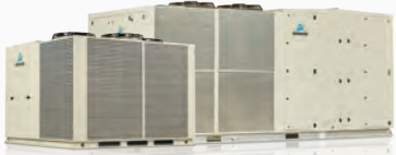
Packaged 15kW – 196kW

NOTE: Group Control not compatible with ActronAir QUE system.