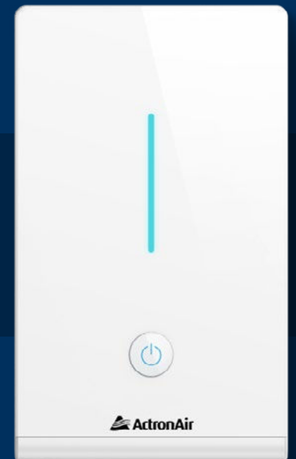
NEXUS Zone Sensor Physical Dimensions (H x W x D): 114mm x 70mm x 17.5mm

NEXUS Zone Sensors provide accurate temperature readings for each room, ensuring every space is just the right temperature. Enjoy personalised comfort where you need it most.