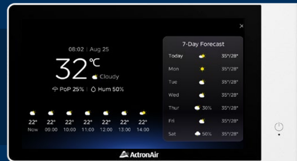
NEXUS TOUCH Controller Physical Dimensions (H x W x D): 110mm x 203mm x 17.5mm

Ensure your home's comfort settings stay just as you want them with the added security of a child lock. Easily turn it on or off using a 4-digit password, giving you peace of mind that your system is protected from unwanted changes.